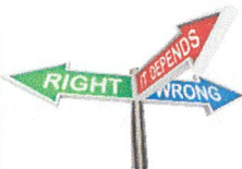
The Seven Principles of Wisdom